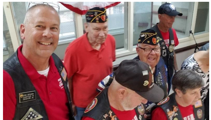
Post 15 volunteers help celebrate birthdays at Tut Fann Veteran's Home.