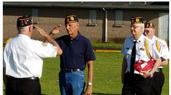
Flag Day Ceremony at Post 15.