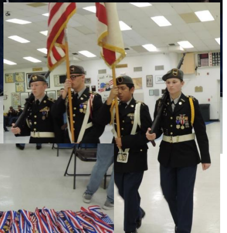
Post 15's 7th Annual JROTC Drill Competition recognized cadets from Decatur High School, Brewer and Priceville High Schools, and Athens High School. All schools were winners in each of the graded categories, and congratulations goes out to Athens High School for reclaiming the Grand Championship Trophy.