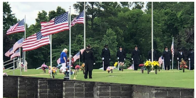
Memorial Day Service at Rose Lawn Gardens