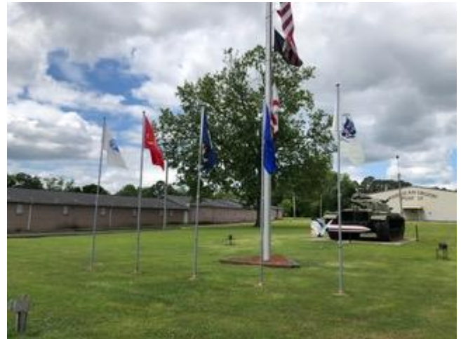
Service Flags Compliment the Post 15 Front Lawn.