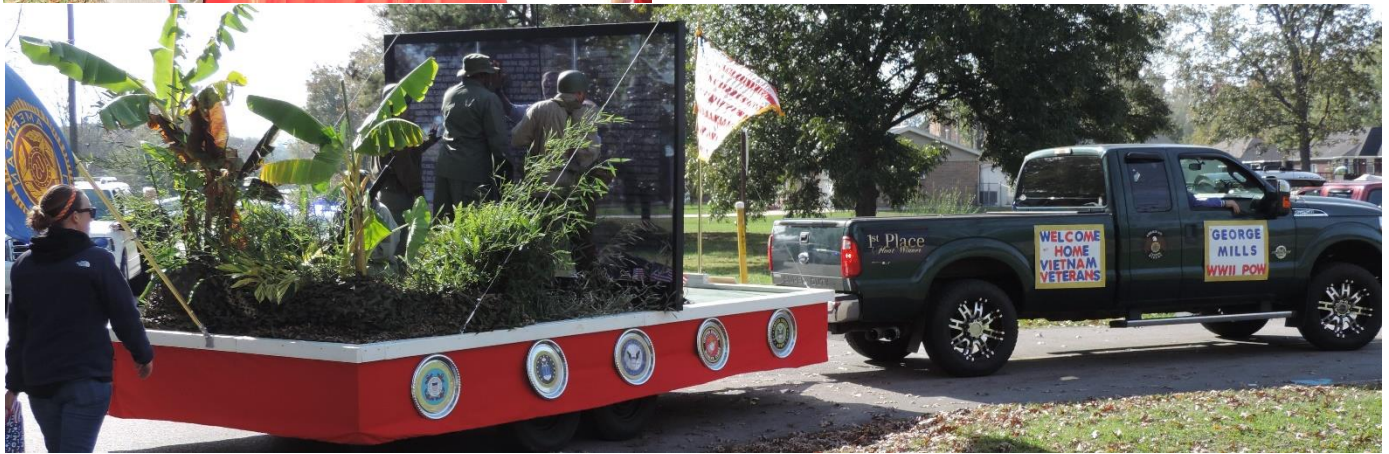
Post 15 Veterans Day Parade Float Honoring Vietnam Veterans. The float was made possible through combined efforts of Legion, Sons, and Auxiliary members.