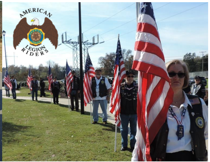
Chapter 15 Riders Promote the American Legion and the Red, White, and Blue.