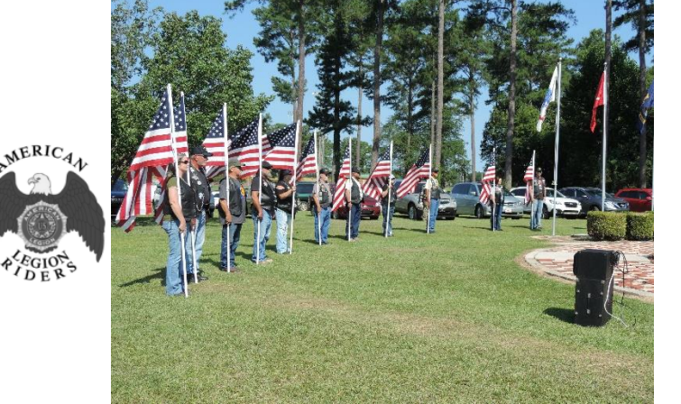
Chapter 15 Riders stand flag line at Hartselle Purple Heart ceremony

Post 15's Annual Early Bird Membership Drive and Fish Fry. Full of Food, Fun, and Fellowship!