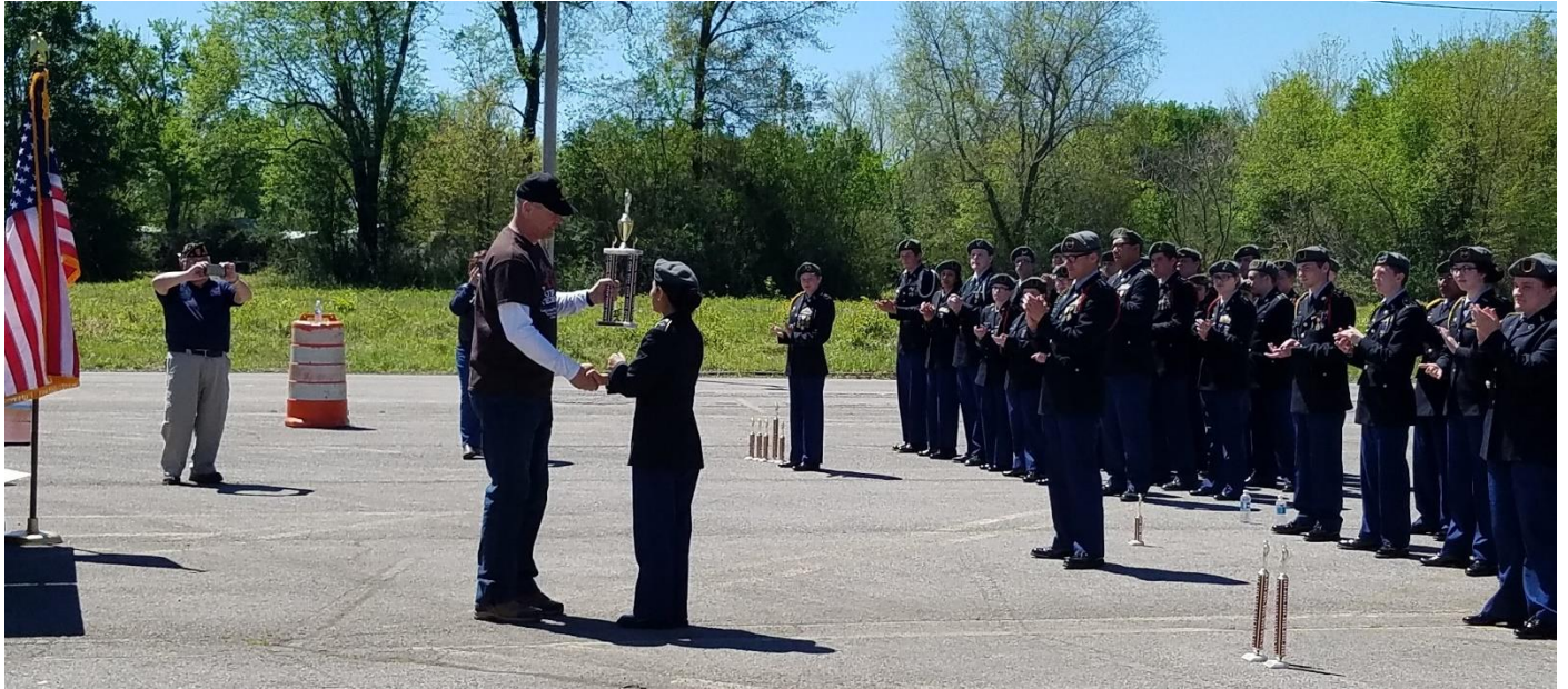
Decatur High Presented the Grand Champion Trophy